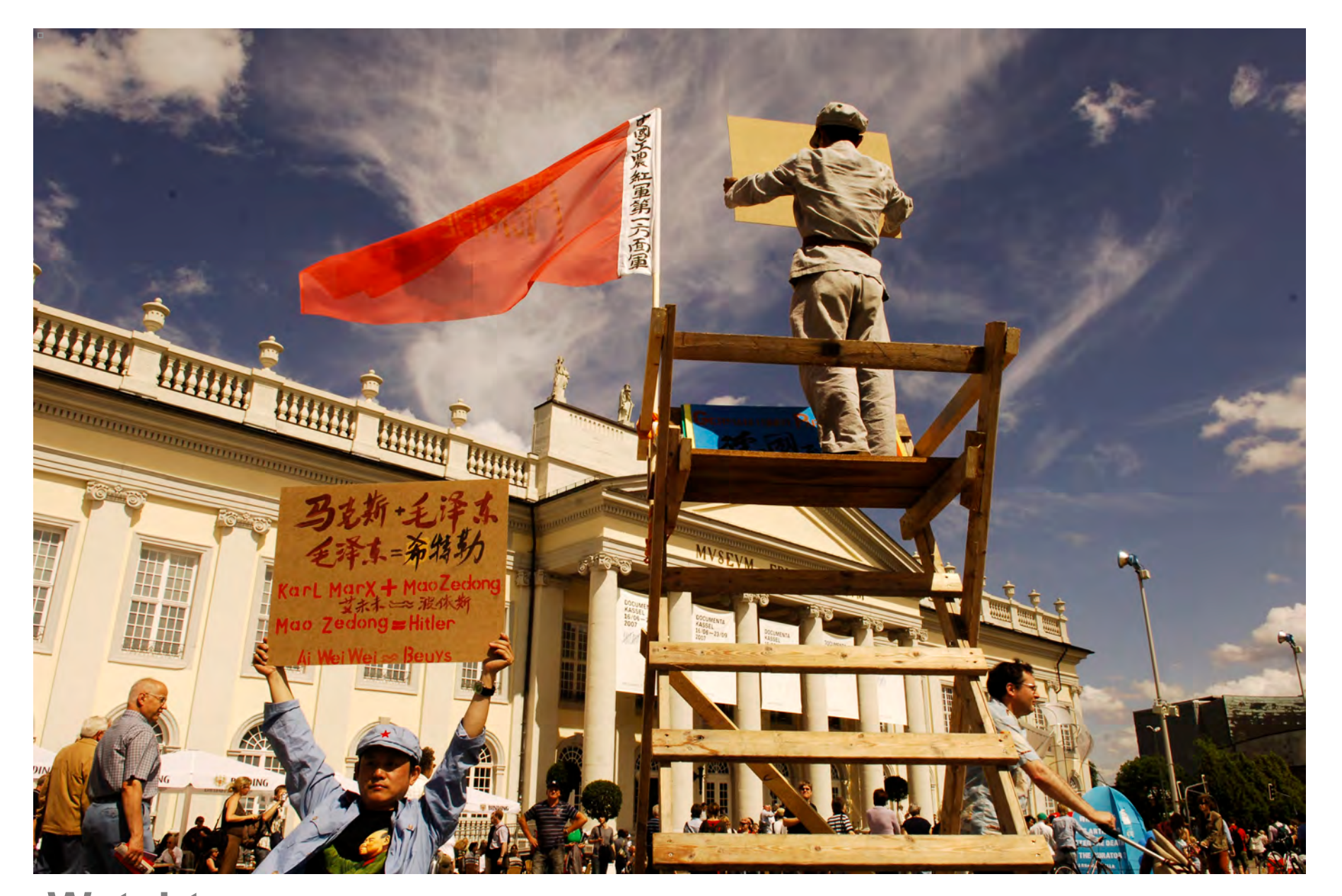
Watchtower spontaneous performance, Documenta XII, Kassel, Germany 2007

Qing and his brother performed Watchtower at Friedrichs Square in front of the main museum in Kassel. The two Chinese artists wore Red Army uniforms and performed on a two and a half meter high wood shelf, called the Watchtower—a reference to the perches commonly used by hunters in Germany.